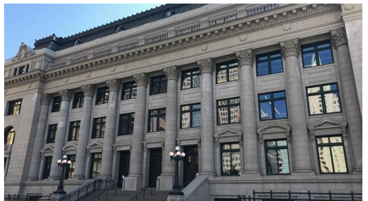
The Dallas Municipal Building/Old City Hall, 106 S. Harwood.

Many know the Dallas Municipal Building on the east side of downtown on Harwood because that is where Lee Harvey Oswald was held as a suspect by the Dallas police and where he was shot by Jack Ruby. However, even if the events of November 22-24, 1963 had never occurred, this building would still have been historic and important. First constructed in 1914 when Dallas did not yet have paved streets or electric lights, the Beaux Arts-style building was the center of Dallas city government for over sixty years.