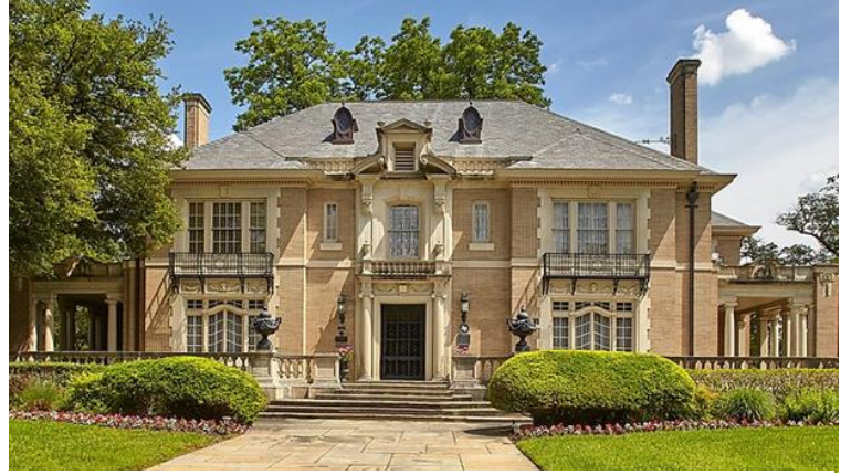
The Aldredge House at 5500 Swiss Avenue was built in 1917.

While no one has yet built a time machine that will actually allow us to return to that era, the Friends of Aldredge House and a group of dedicated actors in period costumes clearly provide us with the next best thing.