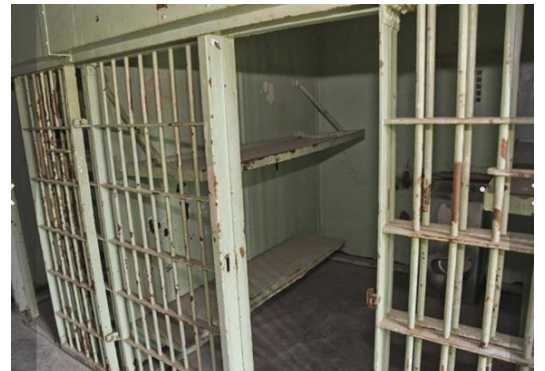
Lee Harvey Oswald's jail cell.

Many important items associated with November 1963 have also been preserved, including the row of jails cells that once held Oswald and Ruby, the mugshot wall where both men's police photos were taken, the prisoner elevator, and the captain's office where Oswald was interrogated.