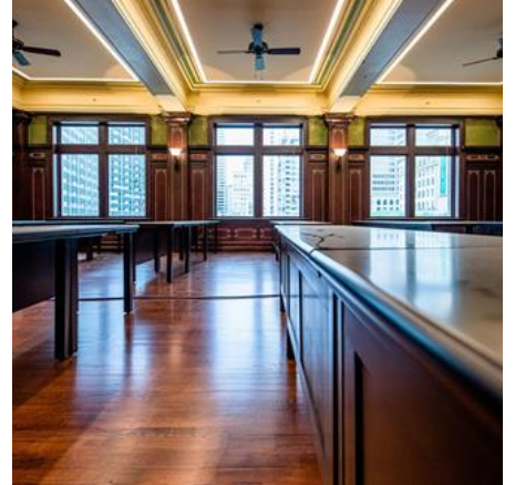
The building's restored grand staircase, the uncovered WPA-era mosaic tile, and the restored council chambers.

Many important items associated with November 1963 have also been preserved, including the row of jails cells that once held Oswald and Ruby, the mugshot wall where both men's police photos were taken, the prisoner elevator, and the captain's office where Oswald was interrogated.